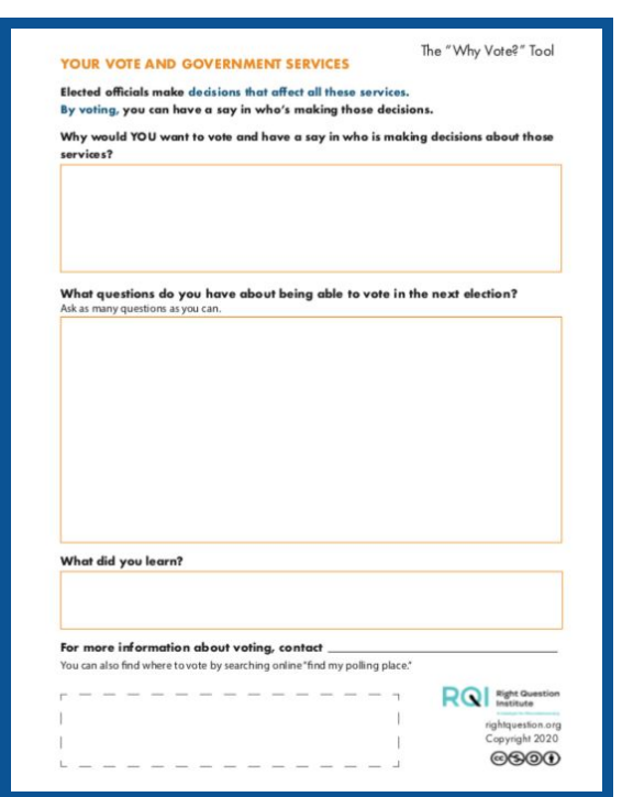
See appendix for a full-size copy of the "Why Vote?" Tool, and visit rightquestion.org/voter-engagement/resources for more resources.

To engage people around voting, the "Why Vote?" Tool can be used by staff and volunteers in social services organizations, community groups, schools, parent advocacy groups, health care systems, and myriad other organizations that provide direct services to the public. These organizations often have a powerful interest in advancing the voices of communities and individuals they serve, and they can be powerful facilitators in the pathway toward voting — and are currently underutilized for that purpose.